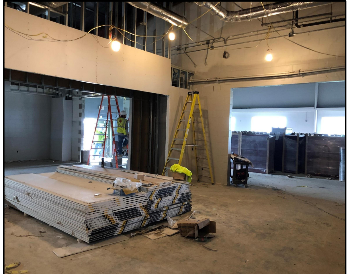
Field House Renovations