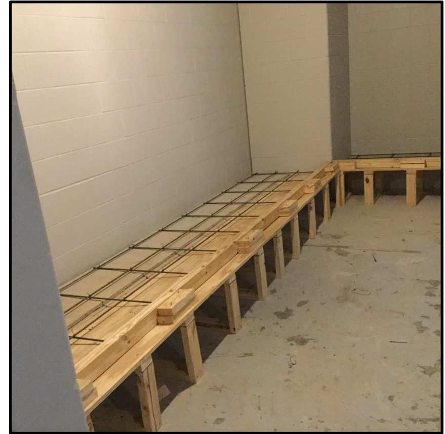
Field House Renovations