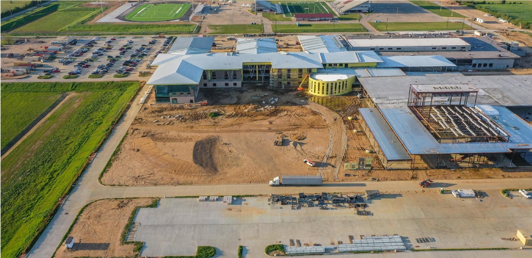
Front-North Elevation from Waller Spring Creek