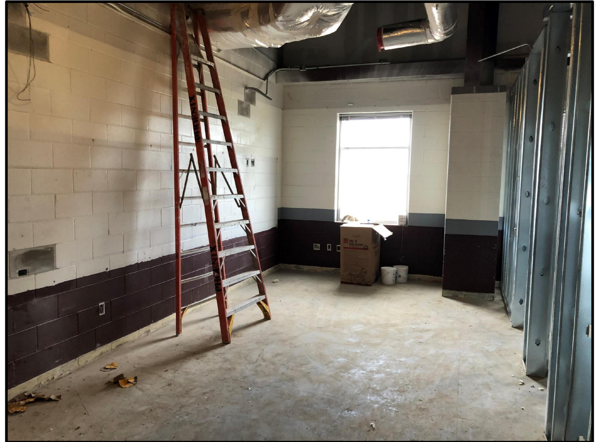
Field House Renovations