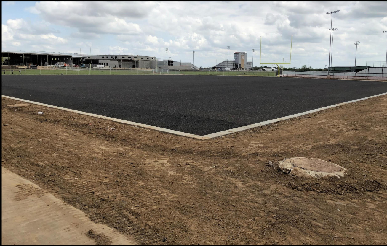
60 yard Synthetic Practice Field